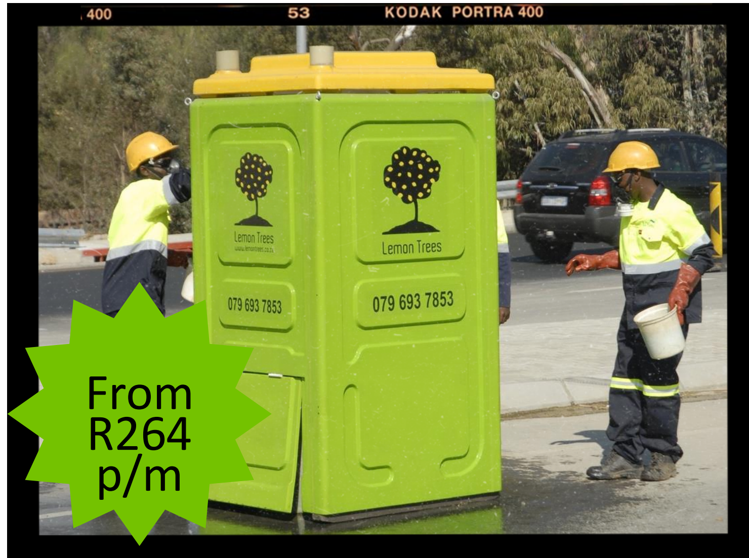
Budget Fibreglass Non-Flush

Our budget fibreglass is perfect for a lower-budget construction site. Price excludes minimum once a week services, delivery/collection and VAT