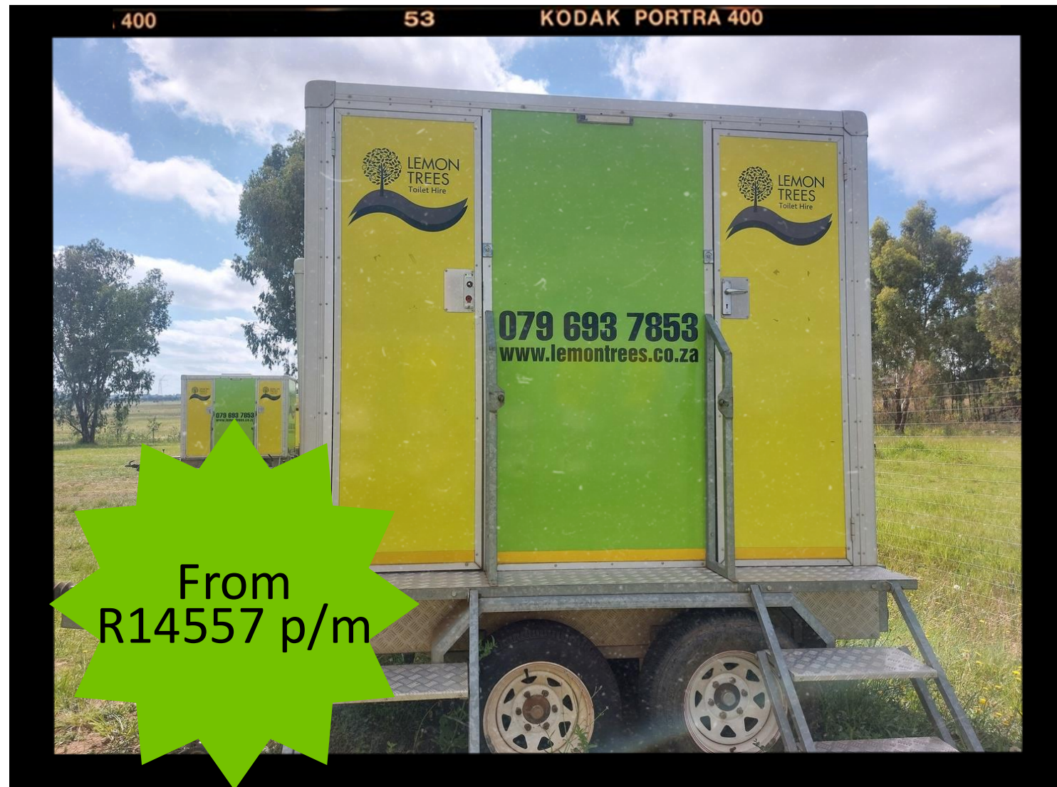
2 Door VIP Trailer Units

We rent out our VIP 2 Door Trailer Units for long-term use on Construction Sites. Price excludes minimum once a week service, delivery/collection cost and VAT