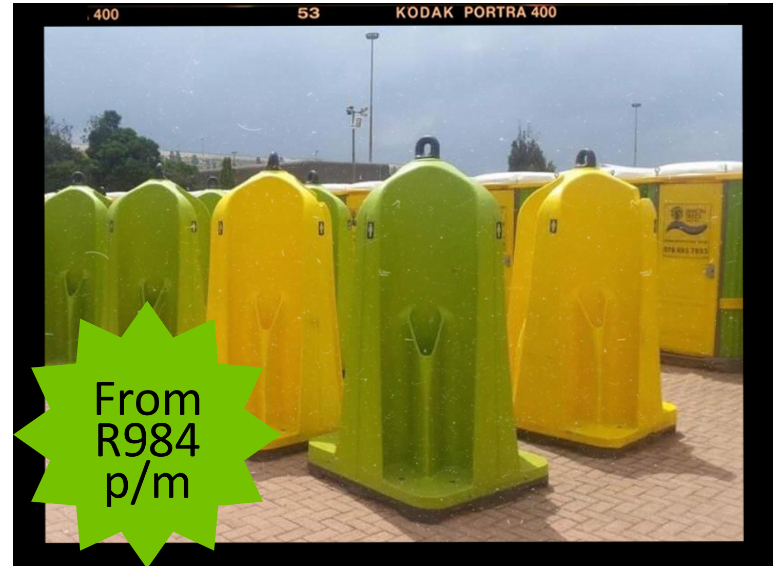
4 Way Kross Urinals

Our 4 - way Urinals Units are very popular on high volume sites as it relieves pressure on Portable Units and handles the equivalent of up to 4 toilets. Price excludes minimum once a week services, delivery/collection and VAT