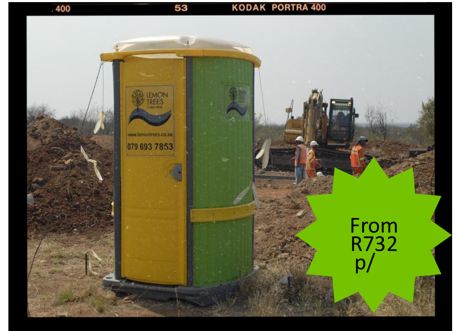
Polyjohn Executive Flush

Our executive flush comes fully equipped with wash hand basin. Price excludes minimum once a week service, delivery/collection cost and VAT