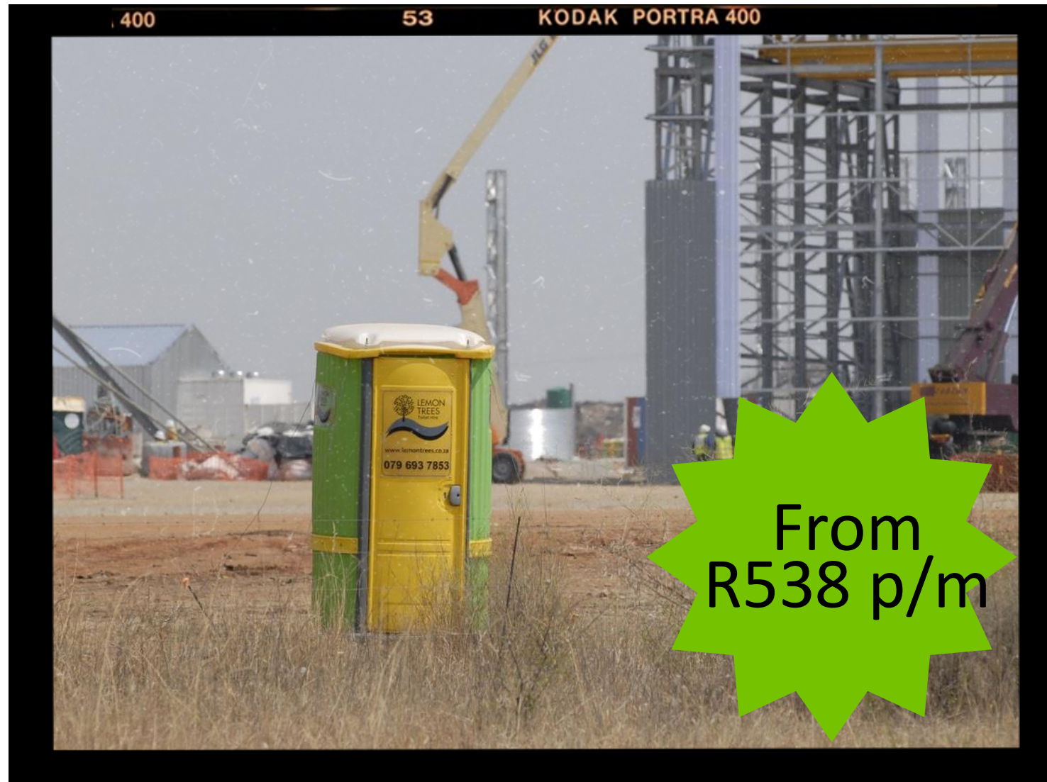
Polyjohn Standard Flush

Our Standard Flush is our preferred unit for most construction sites. Price excludes minimum once a week service, delivery/collection cost and VAT